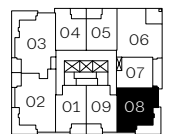
North Rd Levels 4-17